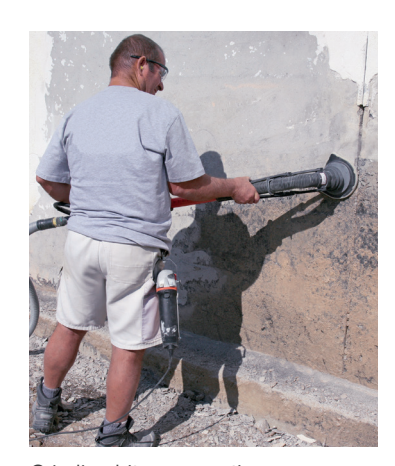
Grinding bitumen coating with PCD grinding disc