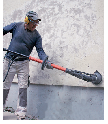
Removing old plaster and paints

Optional accessory Unit No. Fig. Shoulder strap 1 05100 10